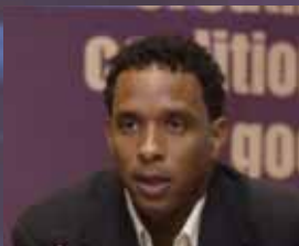
Shaka Hislop: Players must take responsibility