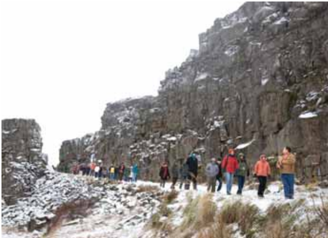
Delegates visit Alþingi at Thingvellir where the Icelanders founded a parliamentary institution in the year 930