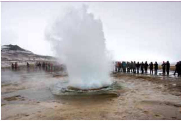
The geyser Strokkur erupts very reliably every 5-10 minutes, hurling boiling water to heights of up to 20 metres (70ft)