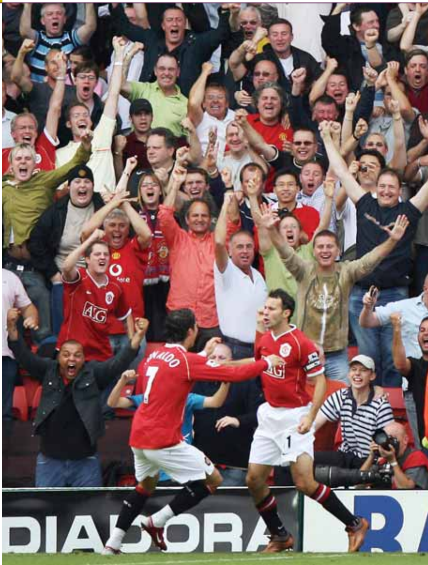
Money is rolling in for English football clubs. Still, the majority have financial problems.