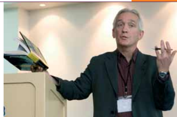
Journalist from The Sunday Times, David Walsh, lost his illusions about cycling, and embarked upon a quest for truth.

Both Walsh and his friend admired one especially successful rider in the peloton. "This particular morning we had the luck to speak with our great hero, chatting about the weather and his chances to win. As he was off to leave, we heard the unmistakable and easily recognisable sound of pills rattling in a plastic container in the back pocket of