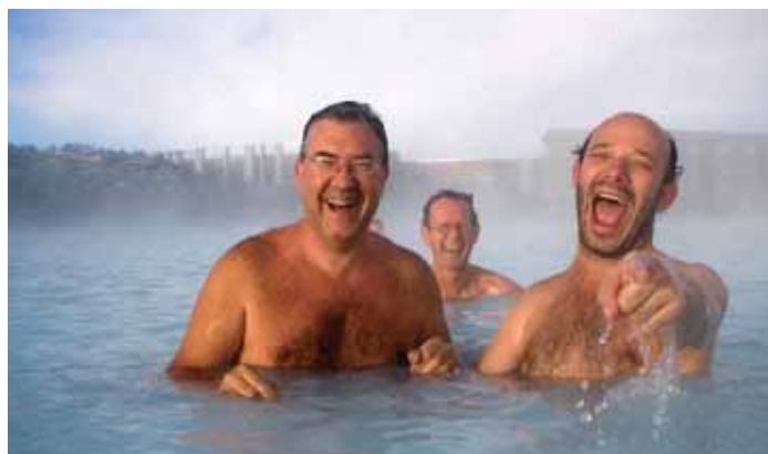
Delegates relaxing in the Blue Lagoon

"And I did get the chance to walk on ice, under falling snow and howling wind and get thoroughly wet in a way only a Viking could understand".