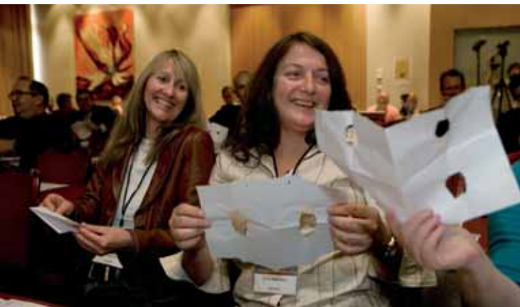
Smiles at the opening session