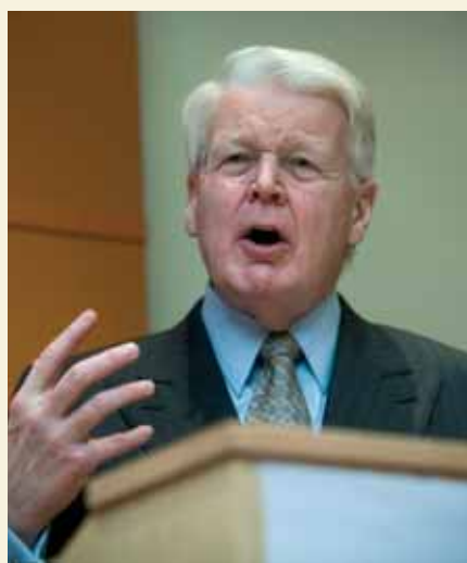
According to the Icelandic President, Ólafur Ragnar Grímsson, sport is an excellent tool to make changes in our societies.

“So the struggle of the campaign against