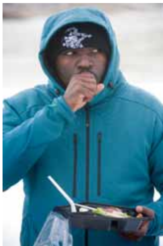
Freezing packed lunch at Thingvellir