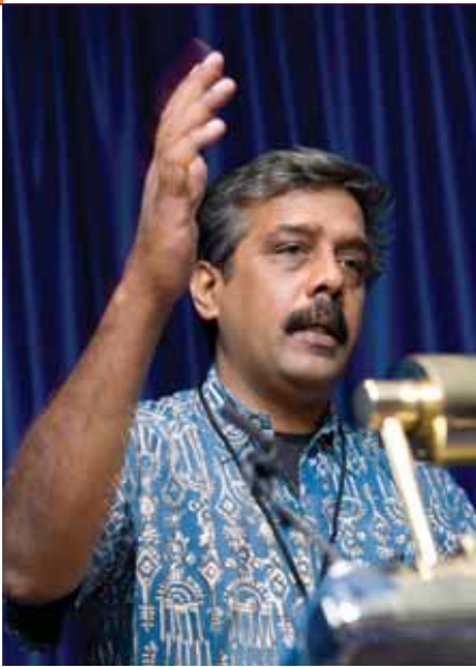
Indian journalist Murali Krishnan told delegates about the massive match fixing in Indian cricket, where the amount of betting money shifting hands can reach 250 million US dollars in one day.