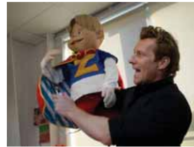
Visit at LazyTown Studios (see article page 27)

In 2007, the Icelandic Youth Association (UMFI) could celebrate its 100 anniversary. As part of the centenary celebrations, UMFI invited Play the Game to Iceland, and the country made many contributions to the conference experience.