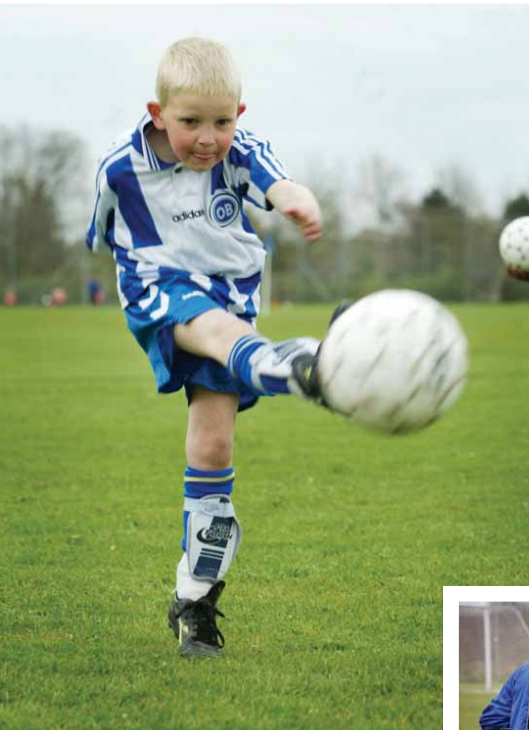
New talents are developed on the basis of playing.