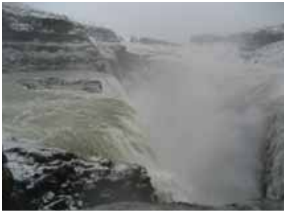
The Gullfoss waterfall is one of Iceland's biggest attractions.