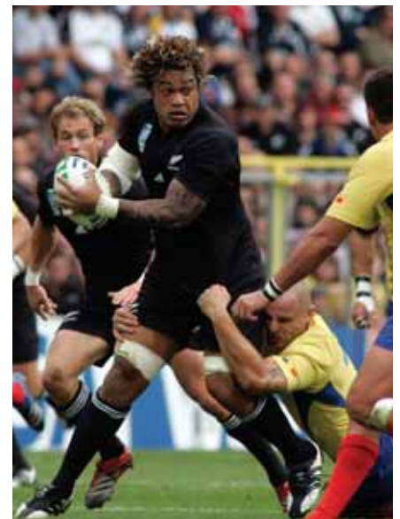
At the 2007 Rugby World Cup organisers tried to limit the number of photos that could be published from the event. Media from all over the world boycotted pre-tournament events to get the demands withdrawn.

Newspaper organisations, news agencies and their professional organisations have banded