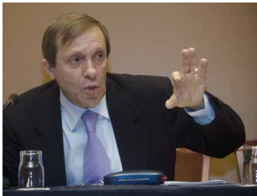
The Italian doping-fighter, Sandro Donati, suggests that all countries set up a Confederation for youth sports in order to separate children and youngsters from the Olympic sports movement.

"Jacques Rogge probably does not even know that sedentariness among young people and the consequent development of metabolism disorders, are also a consequence of the high drop-out rate among young practitioners. They are estranged by an environment where selection and marginalisation are the rule and where the judgement of a young person's achievements are reduced to a mere evaluation of sports results," Donati concluded.