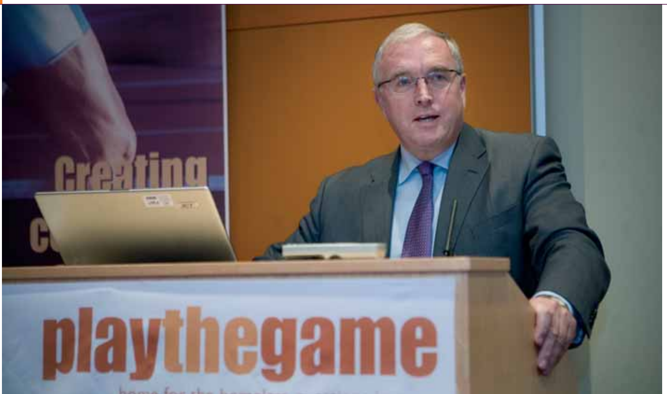
The President of UCI, Pat McQuaid, presented the era of "New Cycling": focus on individual riders and implementation of a massive test programme