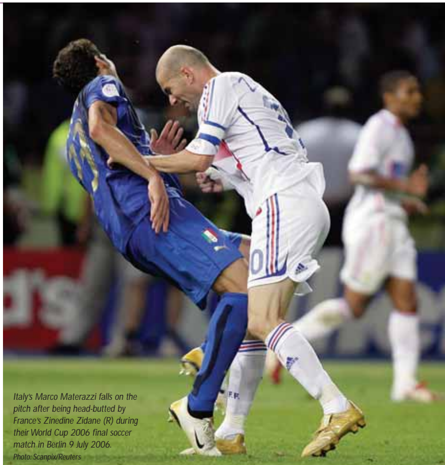
Italy's Marco Materazzi falls on the pitch after being head-butted by France's Zinedine Zidane (R) during their World Cup 2006 final soccer match in Berlin 9 July 2006.