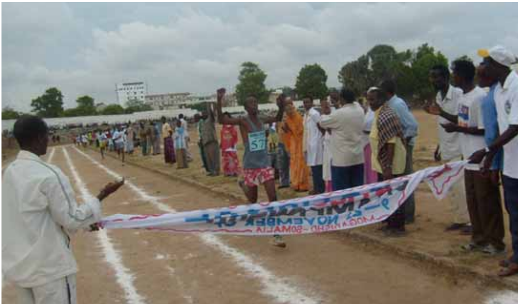
Sport is kept alive in Somalia despite the very insecure political situation and the lack of proper facilities.

Sport and sports journalism struggle for survival in Somalia