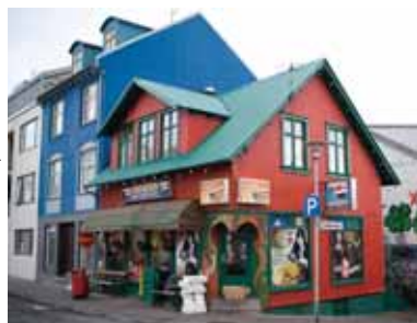
Impresion from downtown Reykjavik