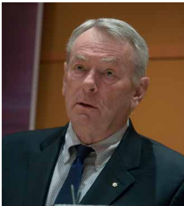
The president of WADA, Richard W. Pound, looked back on his eight years fighting for a cleaner and more fair world of sport.

"I don't see a moral problem with a lifelong ban for doping. If you do it again, I am sorry there is no excuse: Go somewhere else, don't play with us!"