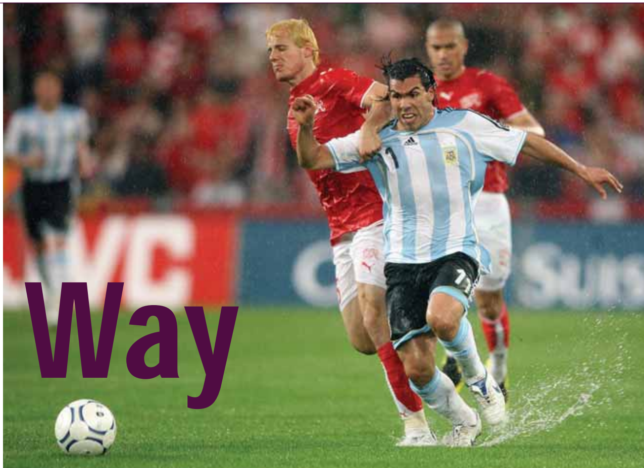
The Argentine football player Carlos Tevez has never belonged to the clubs that "bought" him. He was owned by MSI.