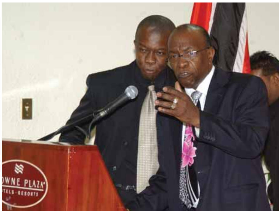
The TTFF's special adviser and FIFA's storm man in the Caribbean, Jack Warner (to the right), has accused the national players from Trinidad and Tobago of greed.

Six years later, the island's players managed to achieve what no other Trinidadians or Tobagonians had achieved before – to qualify for the World Cup – and later had the rare, but dubious pleasure of being excluded from representing their own country because they complained about broken promises from Warner.