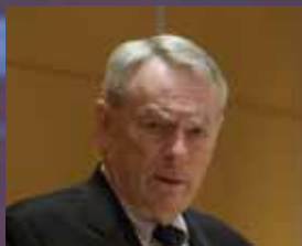
Dick Pound: Backing fight against corruption