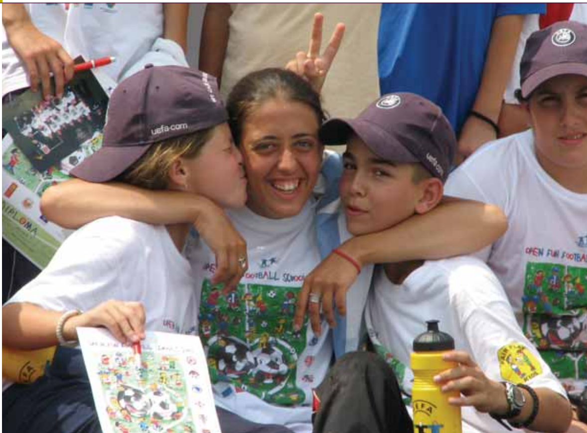
An open football school arranged by Cross Cultures – Open Fun Football Schools. Albanian and Macedonian kids from Kicevo in Macedonia meet and play football across borders.