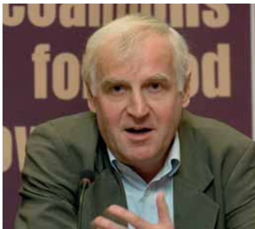
Niels Nygaard, President of the Denmark's National Olympic Committee and Sports Confederation (DIF).