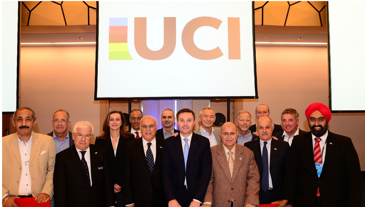
The UCI Management Committee

The UCI Management Committee is the executive body that manages the Federation, acting under the authority of Congress. It meets at least twice a year, headed by the UCI President. Its tasks include executing the decisions of Congress, establishing regulations, awarding the organisation of World Championships and setting up commissions to help it carry out its mission. It also appoints the UCI's Director General.