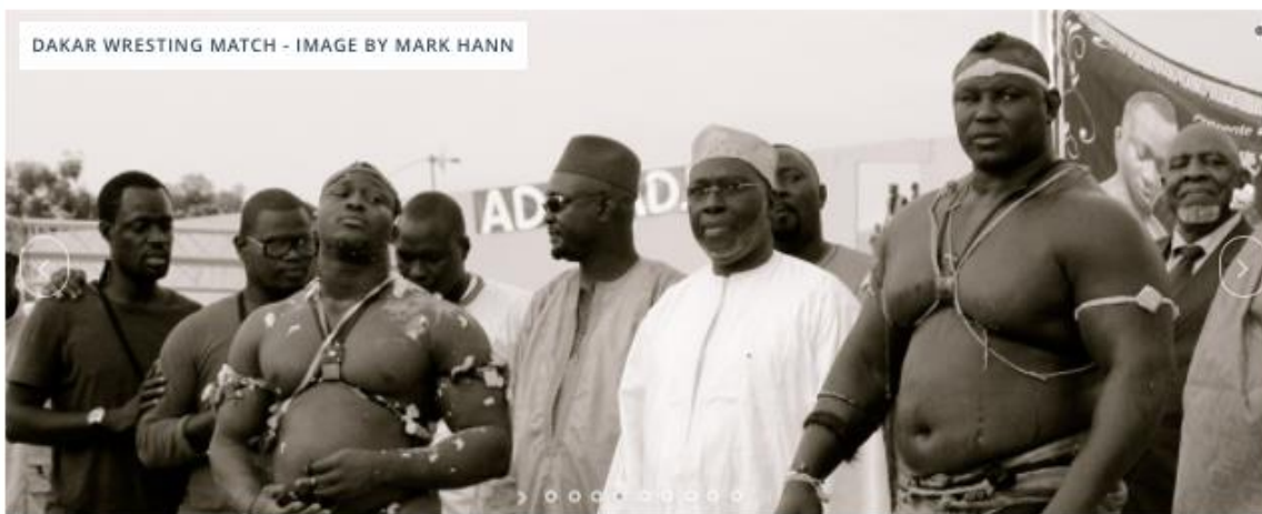
DAKAR WRESTLING MATCH