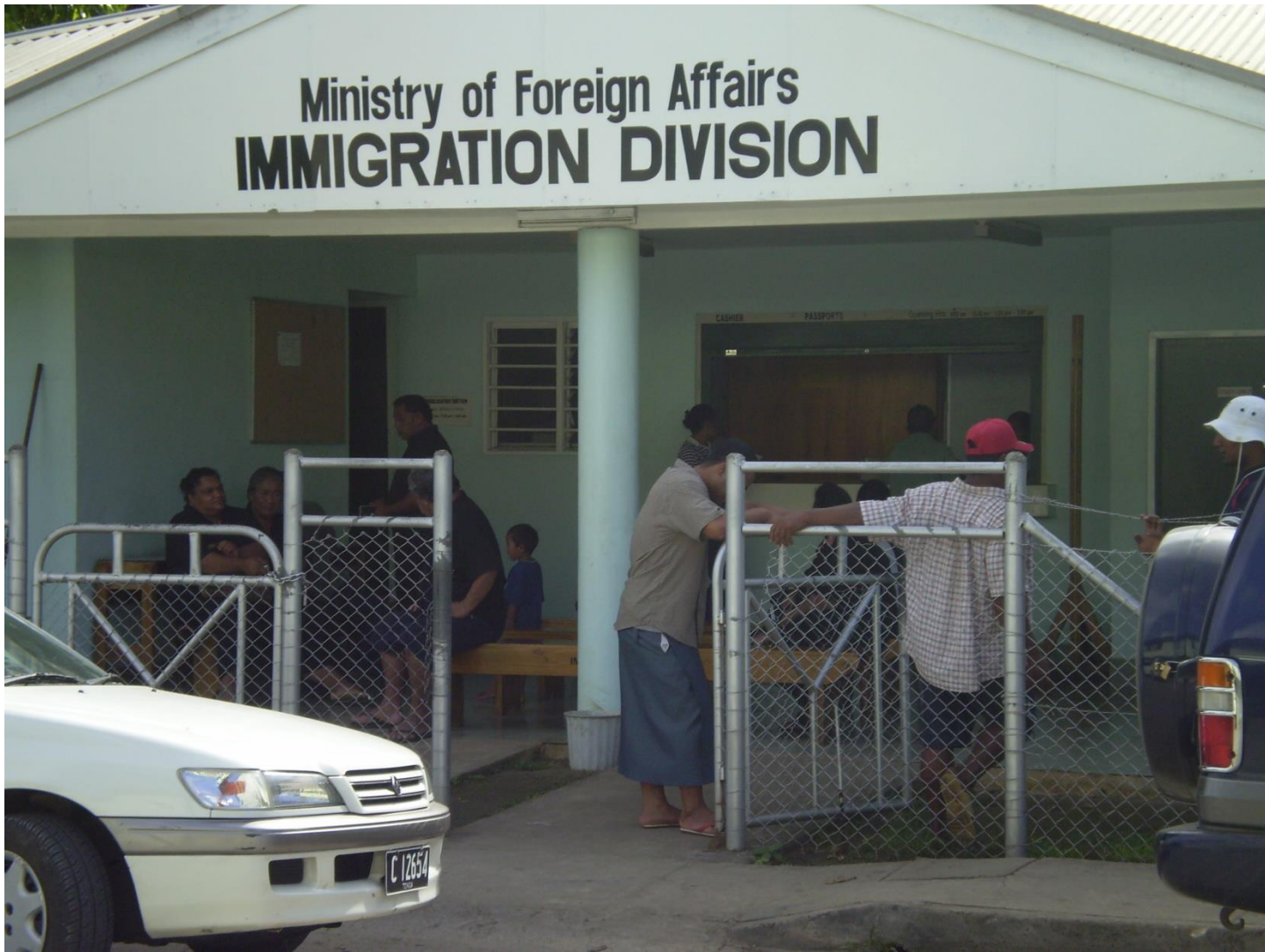
Waiting for new passports at the Immigration Office, Nuku'alofa, Tonga (March 2008)