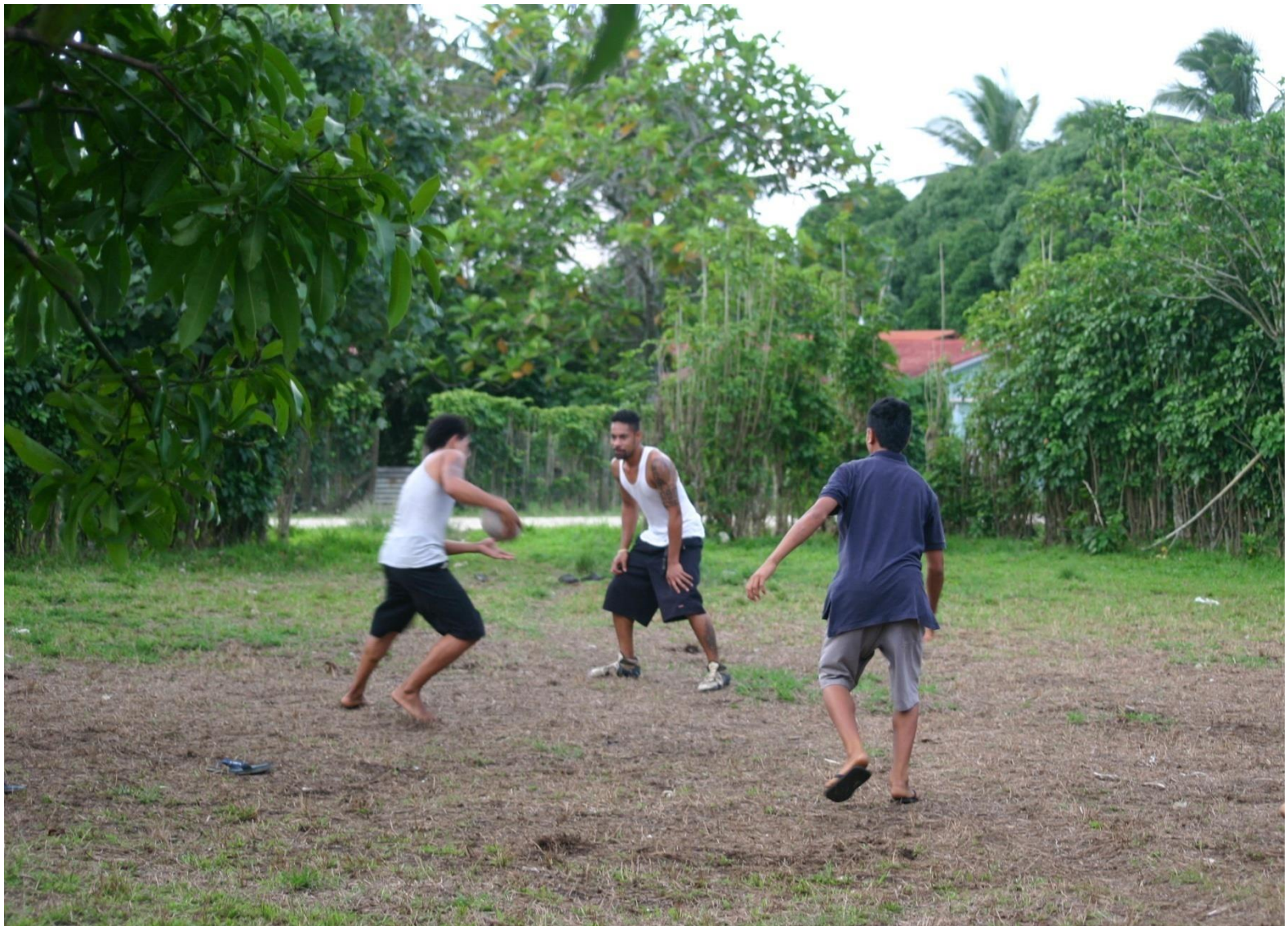
Jeux de rugby « touch » informel au village de Ha'ateiho, Tonga, août 2008